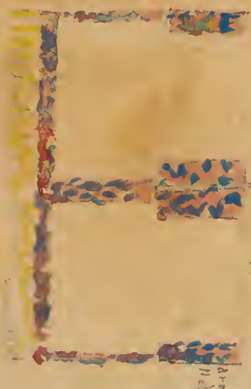
as high for head